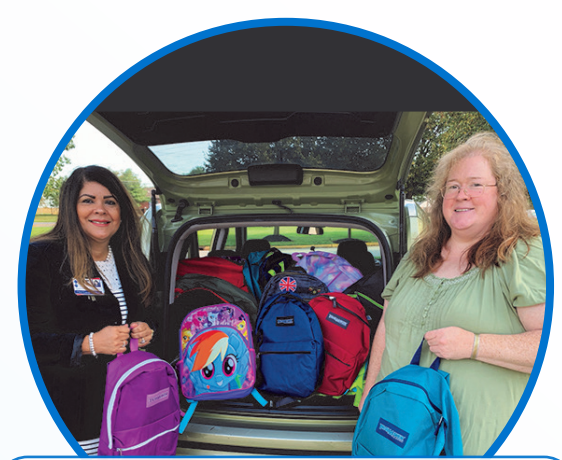
Salem Medical Center donates backpacks and school supplies to ensure students are equipped to learn.

ocial determinants of health are the daily aspects of New Jerseyans' lives - including housing, food, education, employment, transportation and other societal issues – that influence the potential for all individuals to lead healthy lives. These programs took on even greater importance in the pandemic's first year when interruptions to employment and schools underscored the vulnerabilities facing many residents, from housing to child care to Internet connectivity.