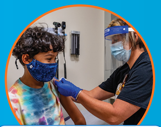
Healthcare teams at Saint Peter's University Hospital vaccinate local youths against COVID-19.

OVID-19 arrived in New Jersey in March 2020, sparking an historic response by N.J. hospitals to protect their communities. As they cared for a record-high 8,200 hospitalized patients at the peak of the pandemic, they also joined the largest public health response in a century.