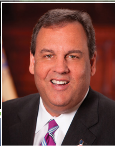
Honorable Chris Christie Governor, State of New Jersey

PROGRAM: 10 a.m. – 3:30 p.m. | SEMINAR: EDU 1726