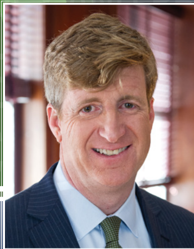
Honorable Patrick J. Kennedy Founder, The Kennedy Forum Co-Founder, One Mind Author, A Common Struggle