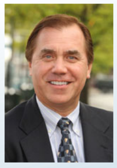
Assembly Speaker Craig Coughlin (D-19)