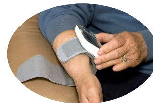
Remote Patient Monitoring