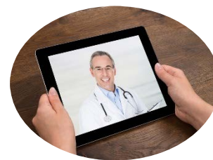
Synchronous Video Consults