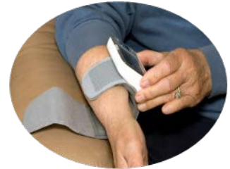
Remote Patient Monitoring