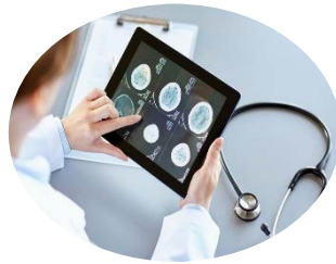
Asynchronous Care (a.k.a. Store and Forward)