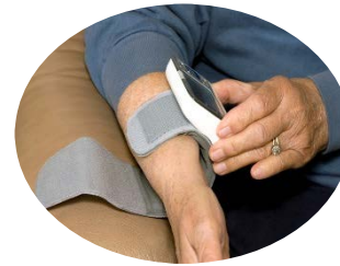
Remote Patient Monitoring